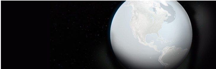
Greenplanet Energy Analytics

The greenhouse effect is a good thing - it warms the planet and makes life possible. Without it the world would be a frozen ball of ice.