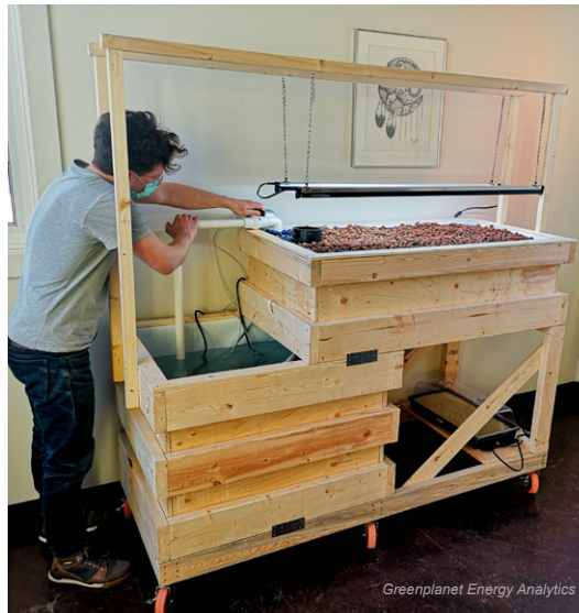
Greenplanet Energy Analytics

Plants use the nitrogen from nitrate for leaf and stem growth. In an aquaponics system, the plants will remove nitrate from the water and keep the water healthy for fish. This is what makes an aquaponics system work!